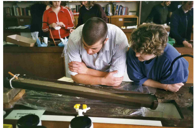
Trainee teachers studying sediment movement in a gutter with flowing water.

It is often possible to see that more dense particles in the sediment accumulate where the flow of water is slow. This is how placer deposits of dense minerals, like gold, form. Dense materials, such as iron filings, or crushed pyrite, could be added to the sand to see where they settle out.