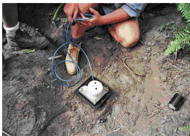
Tiltmeter in use on the volcanic island of Montserrat